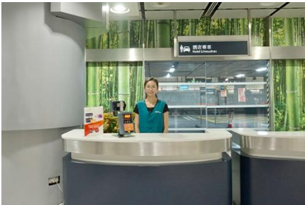
Hong Kong Station